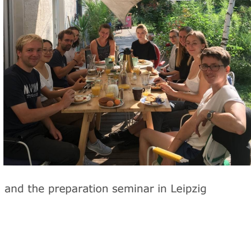
and the preparation seminar in Leipzig