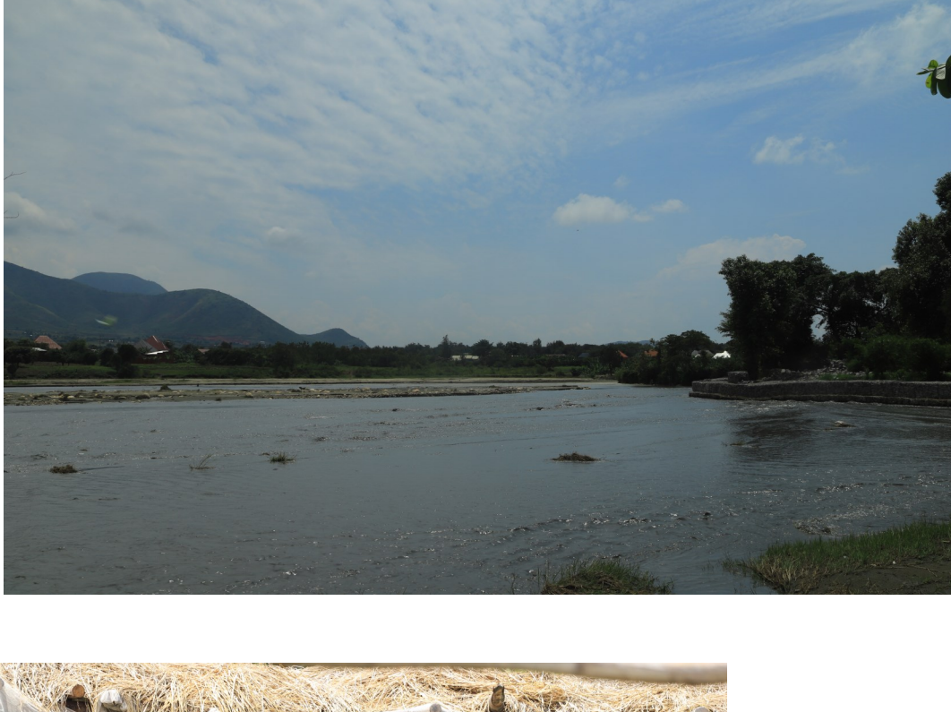
Seedlings have been planted along riverbanks